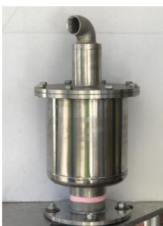
VS-4-P Smartvalve (Potable Water)