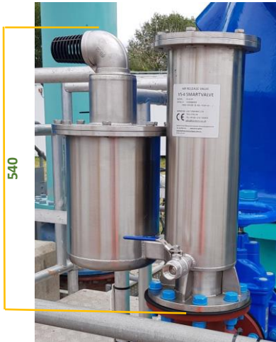
VS-4-HF Smartvalve High Flow