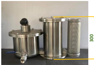
VS-4-XLP Smartvalve (Extra Low Profile)