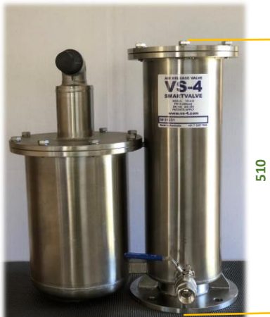
VS-4-S Smartvalve Standard